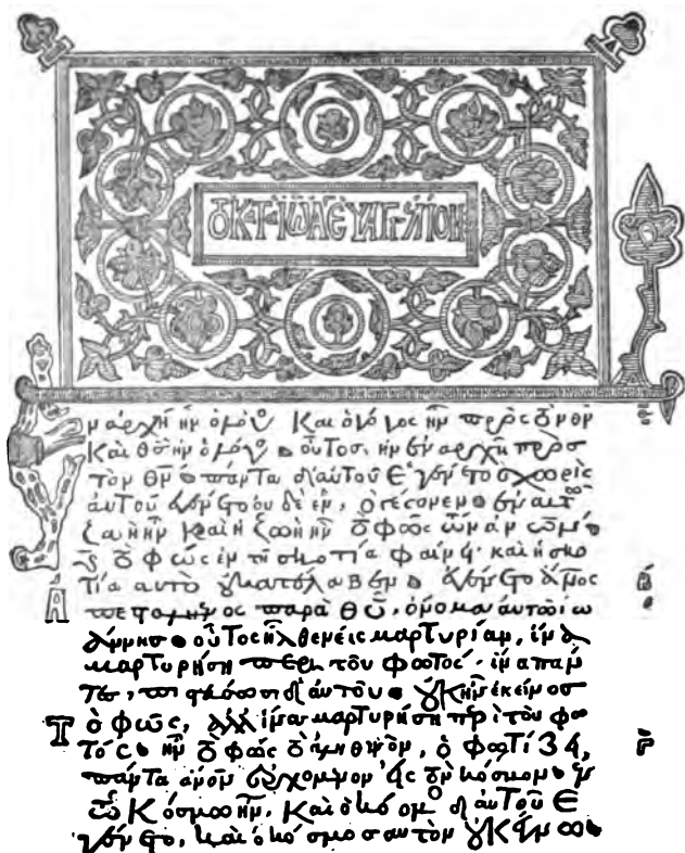
Codex Ebnerianus. John i. 1-10.

The Vatican, No. 1209 in the Vatican Library at Rome. It is very corrupt, has evidently been tampered with, and is remarkable for omissions, lacking the Apocalypse , Hebrews ix. 4 to the end, I and II. Timothy , Titus , and