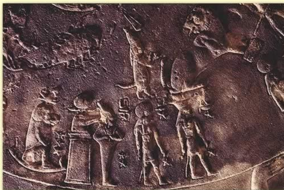
Part of an Ancient Egyptian zodiac

Astrologically we may encounter a few dilemmas here: