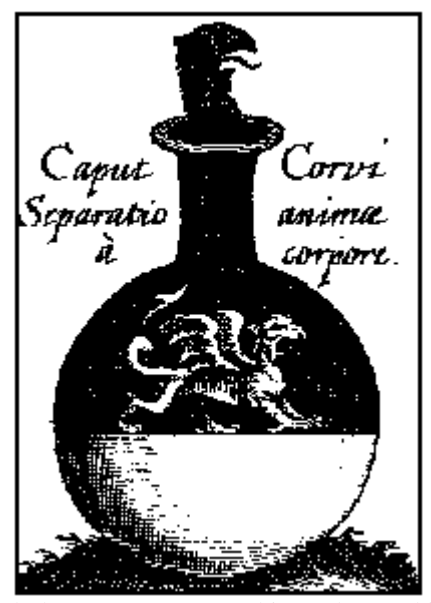
Here beginneth the Dragon to wax white and to eat his own wings.