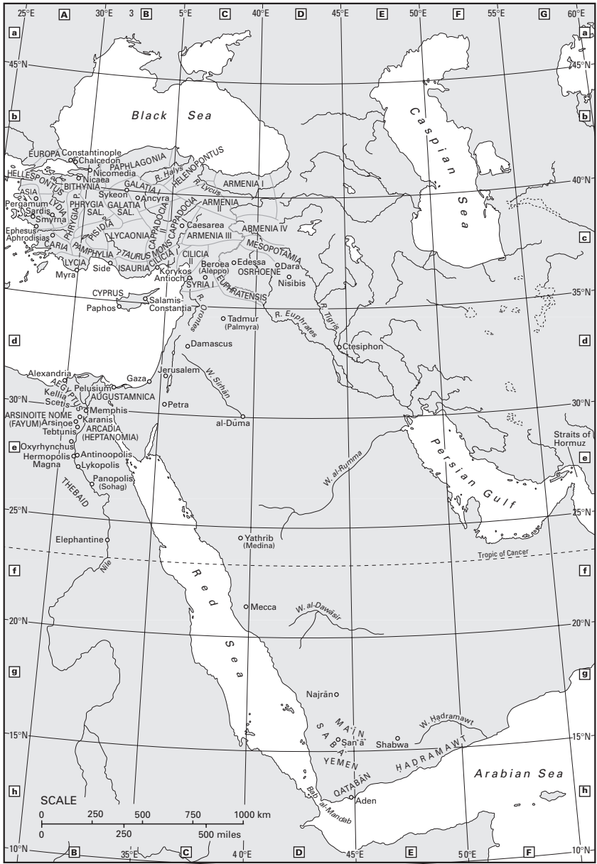
Map 3 Byzantium and the Near East, c. 600