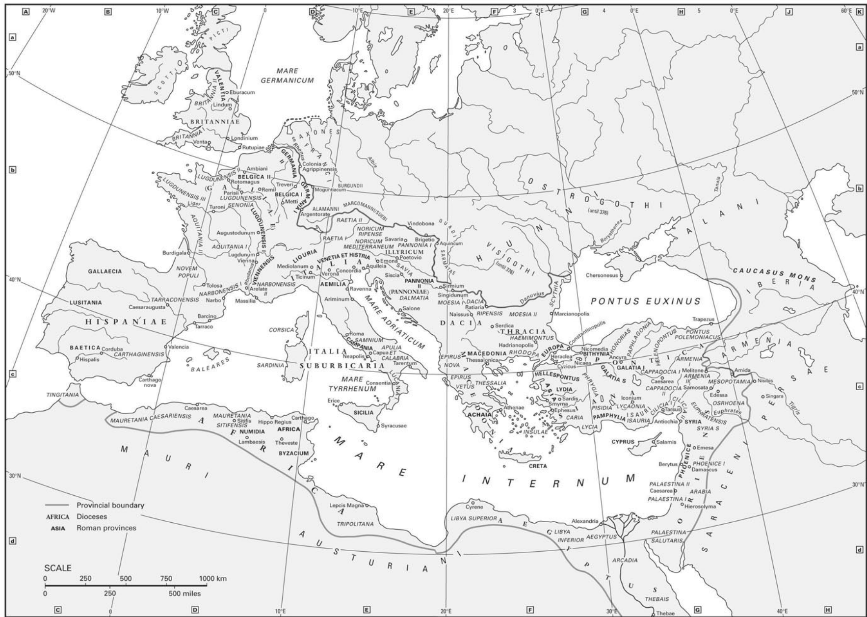
Map 1 The Roman empire, c. 400