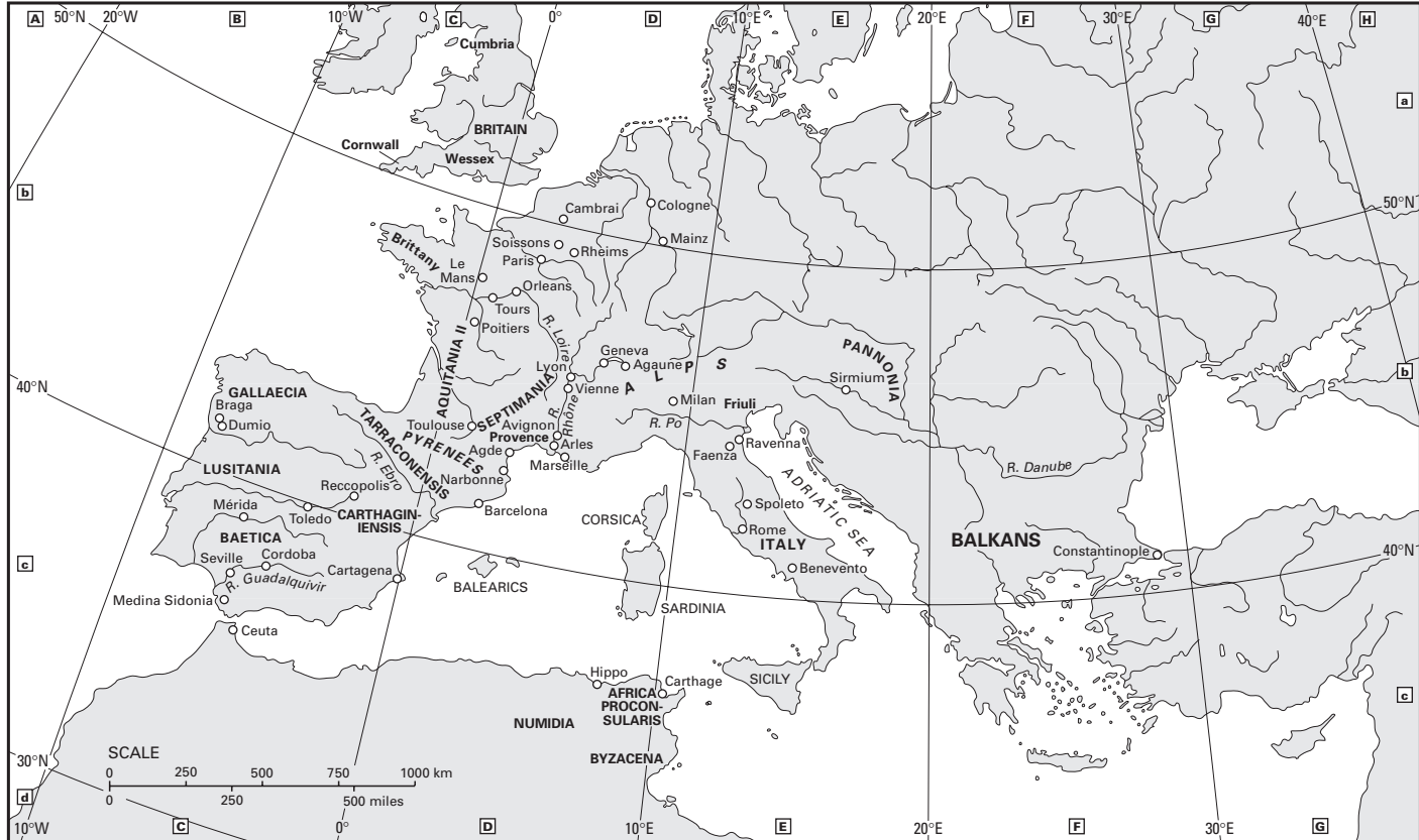
Map 2 Rome and the West, c. 600